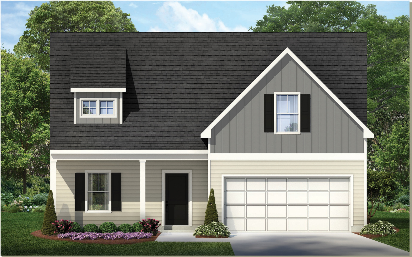
Elevation "B" Featured